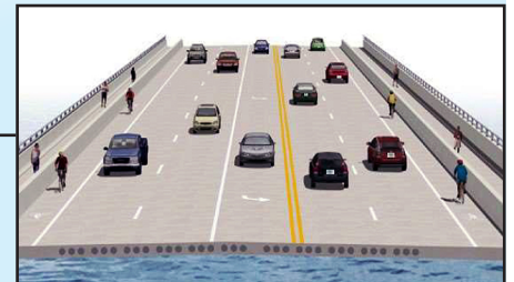
Rendering of Main Street and San Carlos Blvd.