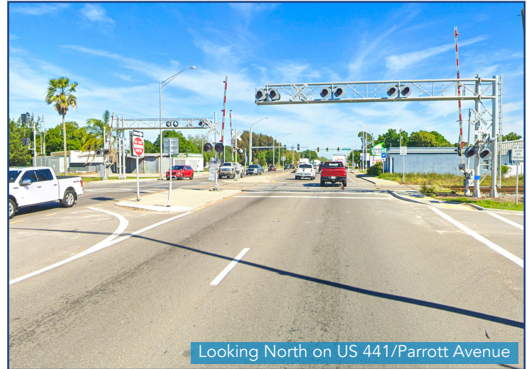
Looking North on US 441/Parrott Avenue

The Florida Department of Transportation (FDOT), District One, is beginning a Feasibility Study to determine the viability of grade separation over CSX railroad tracks crossing US 441/Parrott Avenue in the City of Okeechobee. This study will include operational and safety improvements along US 441/Parrott Avenue between NE 4th Street and NE 13th Street. These improvements are intended to enhance safety for the traveling public along the US 441/Parrott Avenue corridor by separating the vehicle and pedestrian movements from the railroad crossing. If a feasible alternative is developed, the study may advance to a Project Development and Environment (PD&E) Study.