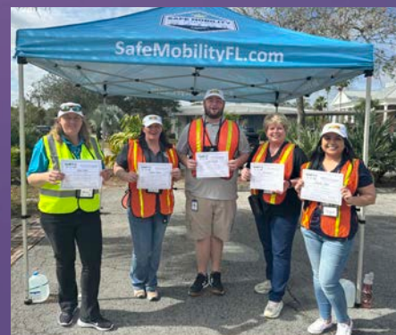
Volunteers attending the CarFit Technician Training. Training for new CarFit Technicians was held on Jan. 23rd.