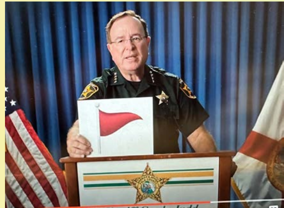
"Speeding and aggressive driving are the leading causes of crashes in Florida", says Sheriff Grady Judd.

The video message can also be seen on gas station pumps at more than 60 locations throughout Polk County.