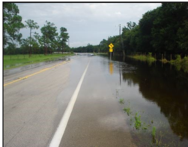
Water is seen overtopping SR 72 at SW Rodgers Avenue in Arcadia, FL. Drainage improvements begin in January 2018.